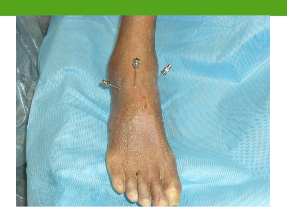
For Medical Research